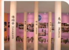
9 Anointing of the Five-Fold Gifts