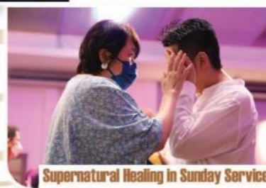
Supernatural Healing in Sunday Services

Different Ministry Platforms Put Learning Into Practice