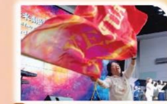
4 Internship "Beingized"