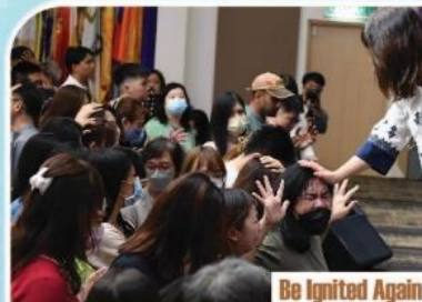
Be Ignited Again

Testify Jesus Glorify God and Edify Men Till the End of the Earth