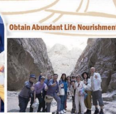
Obtain Abundant Life Nourishment Trip to Mt Sinai