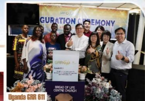
Uganda GRR 611