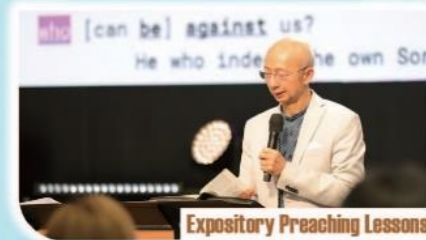
Expository Preaching Lessons