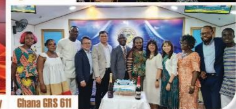
Ghana GRS 611