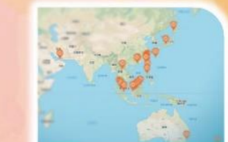
7 Mission Work and Church Planting

611 Leadership Institute (CA Branch) 12 Key Features