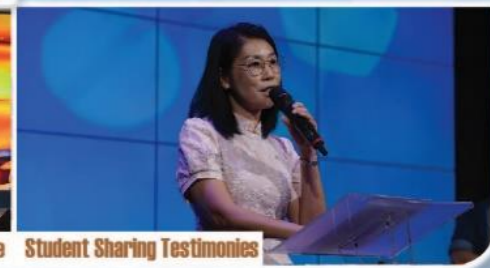
Student Sharing Testimonies