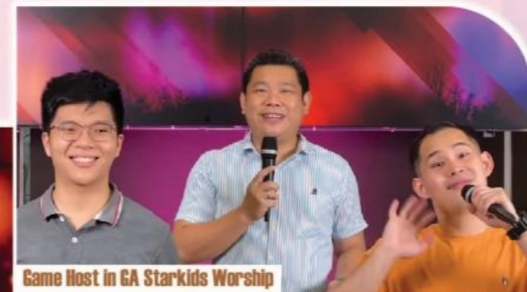
Game Host in GA StarKids Worship

Different Ministry Platforms Put Learning Into Practice