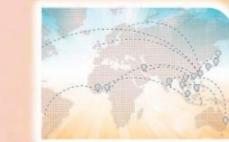
1 Despite the Pandemic, We Harvest