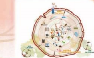
10 MG12 Discipleship Consolidation