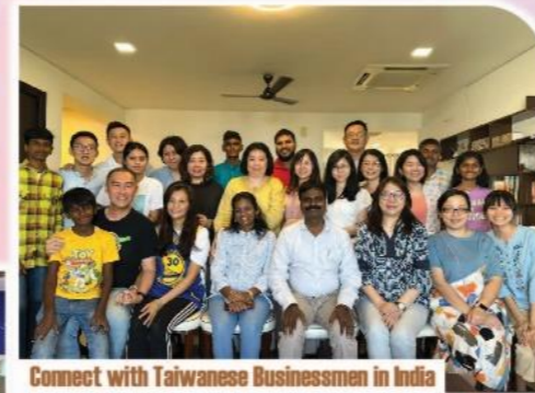
Connect with Taiwanese Businessmen in India