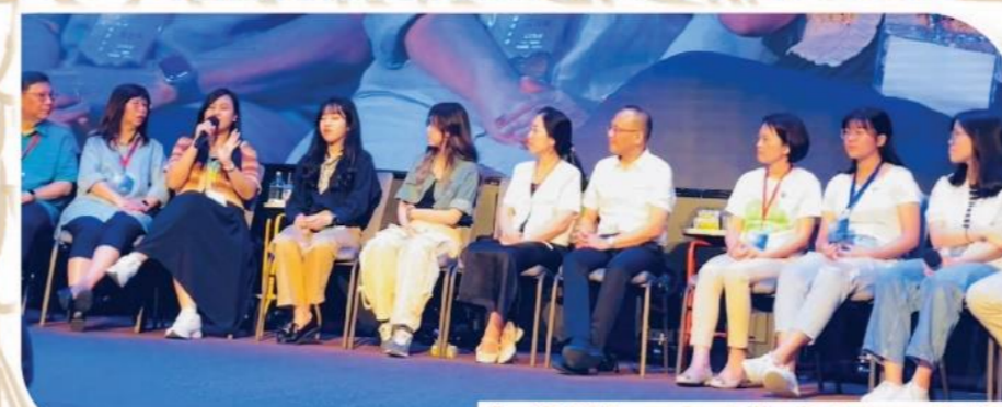
Heartfied 10 Commandments Worship Conference, Kuching