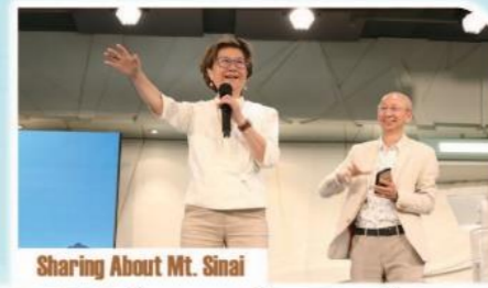
Sharing About Mt. Sinai