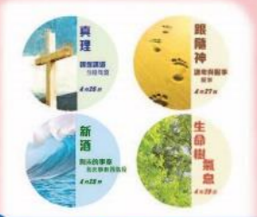
3 Lessons of Four Major Series