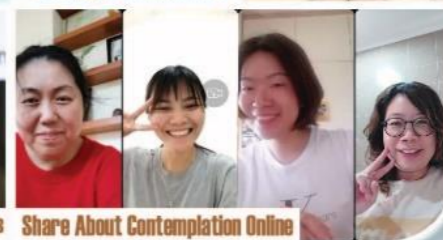
Share About Contemplation Online