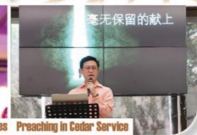
Preaching in Cedar Service