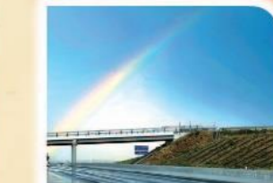
8 Anointing of the Holy Spirit

611 Leadership Institute (CA Branch) 12 Key Features