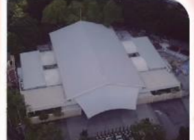
12 Enlarge the Tent, Possess the Land