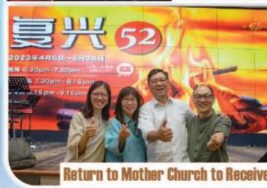
Return to Mother Church to Receive