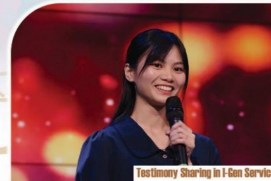
Testimony Sharing in I-Cen Service